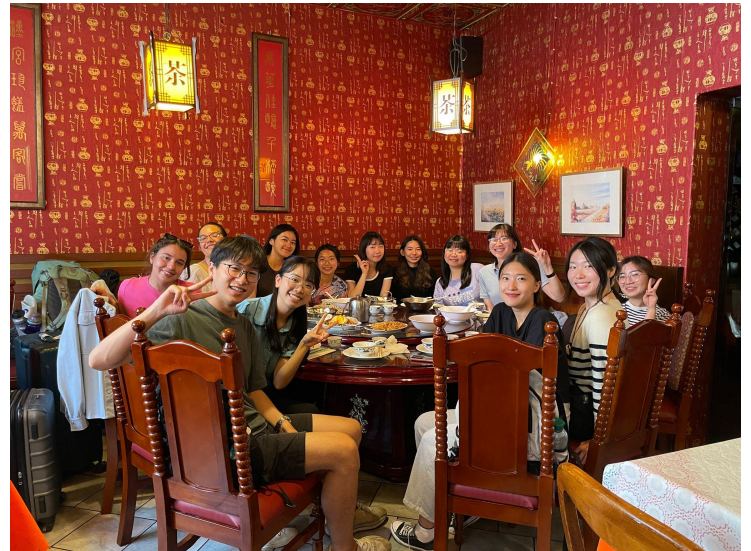
Farewell Lunch with my friends ;(