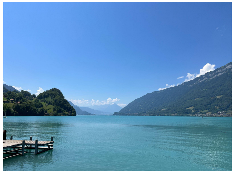
Beautiful views in Switzerland